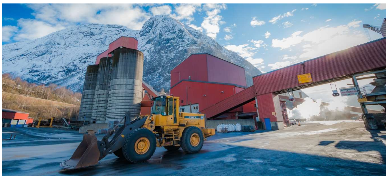
TiZir Titanium & Iron ilmenite upgrading facility, Tyssedal, Norway

Shipments of chloride slag are expected to resume in early April.